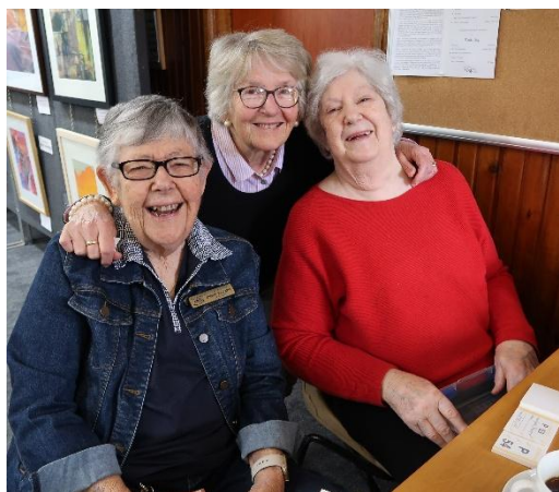
The Front Desk Team letting their hair down.